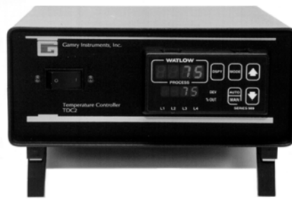
TDC2 Temperature Controller